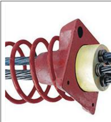
Working Anchor 工作锚